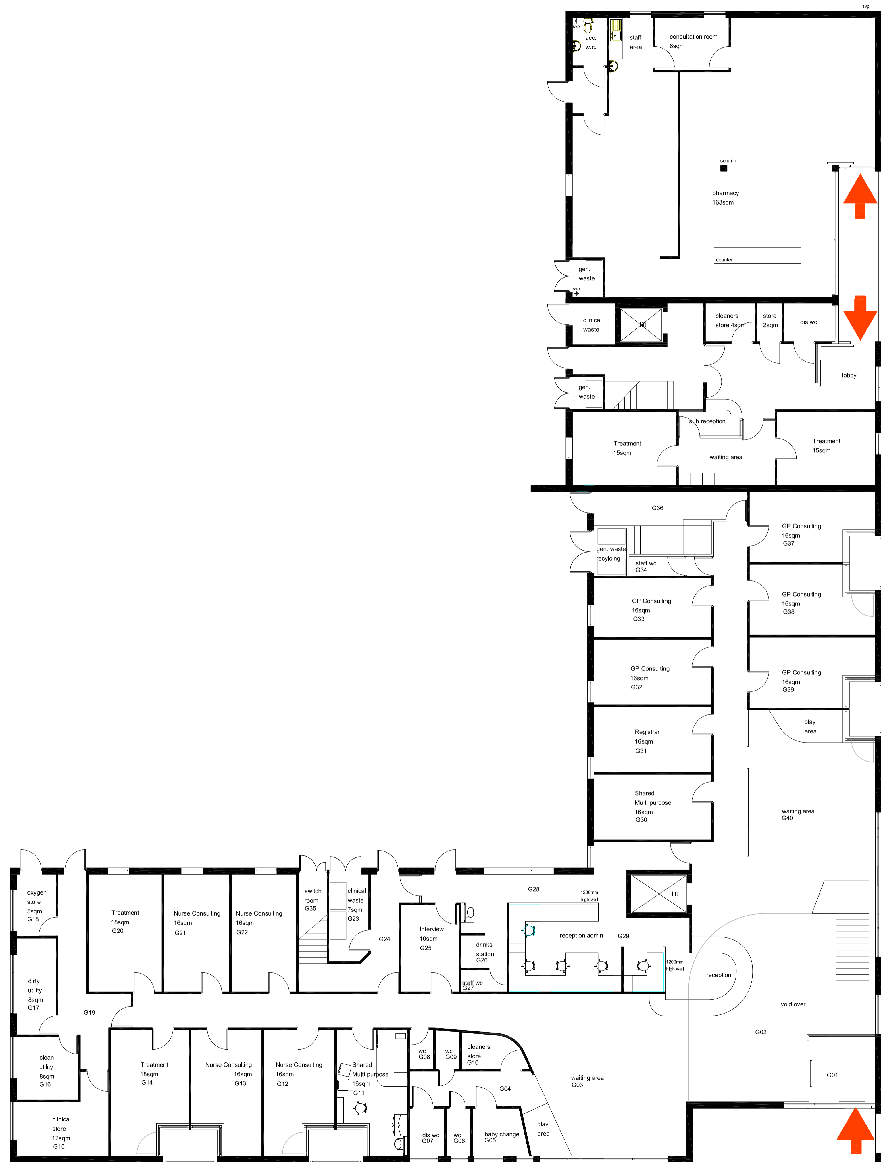
Ground Floor Plan scale 1:100@A1