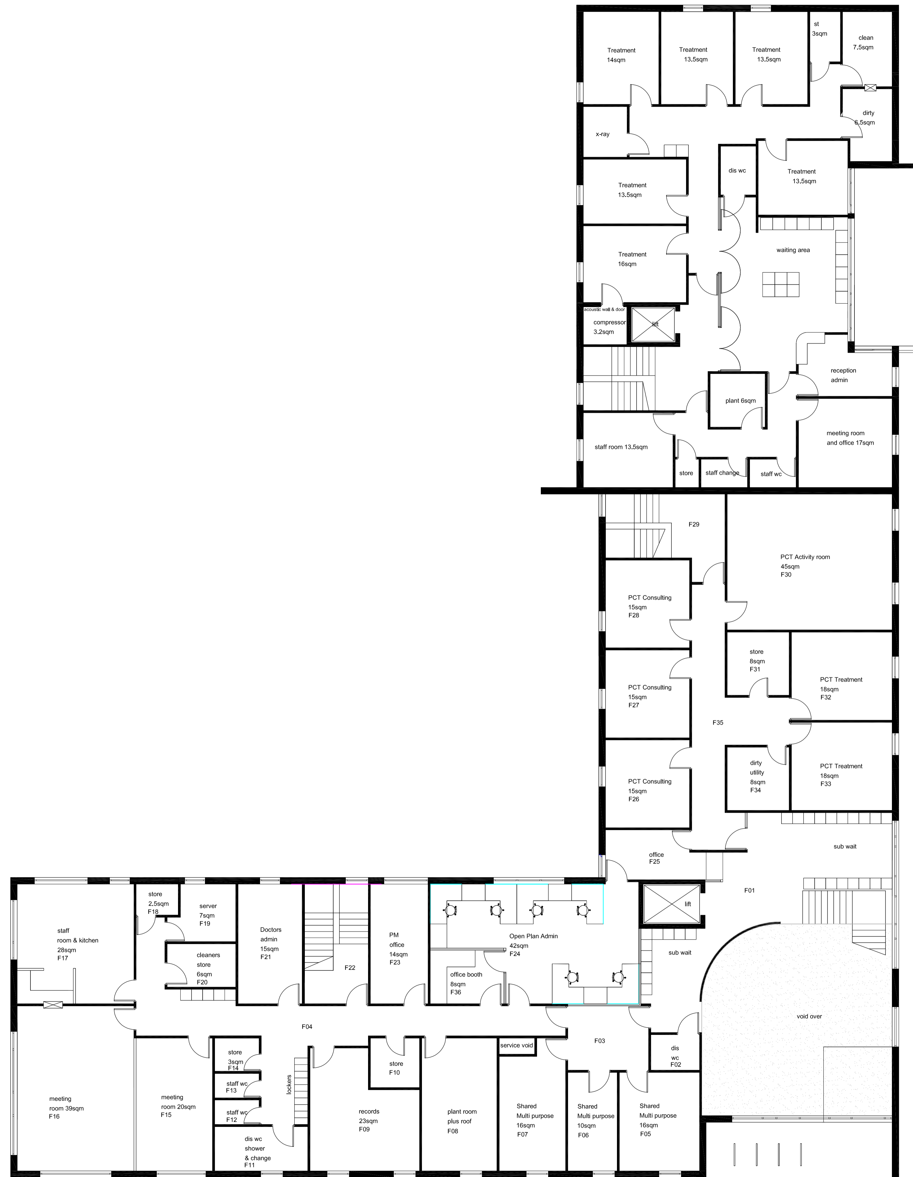
First Floor Plan scale 1:100@A1